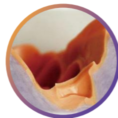
Gingival edge is continuous